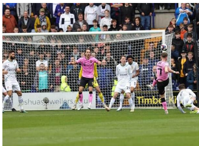
The goal that sealed the Cobblers promotion 2022/2023

On a sporting front the town has a football, rugby and cricket team. The football team "The Cobblers" play at Sixfields Stadium in Division 1. The rugby team, Northampton Saints, play at Franklins Gardens in the Premiership and were European Champions in 2000, Aviva Premiership champions and Amlin Cup winners in 2014 and the inaugural Premiership Rugby Cup winners in 2019. The cricket team were promoted to Division 1 of the County Championship in 2019.