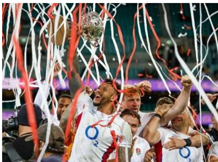
Courtney Lawes England's series winning captain against Australia

On a sporting front the town has a football, rugby and cricket team. The football team "The Cobblers" play at Sixfields Stadium in Division 2. The rugby team, Northampton Saints, play at Franklins Gardens in the Premiership and were European Champions in 2000, Aviva Premiership champions and Amlin Cup winners in 2014 and the inaugural Premiership Rugby Cup winners in 2019. The cricket team were promoted to Division 1 of the County Championship in 2019.