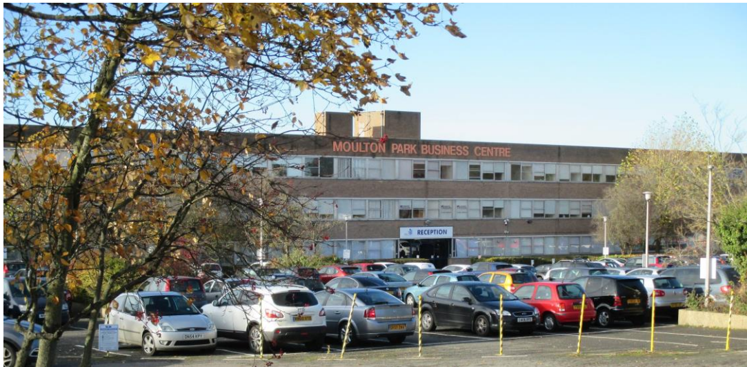
Moulton Park Business Centre – the course location

If you have any questions or require any further information about anything in this guide then please send an email to: training@sierra.co.uk