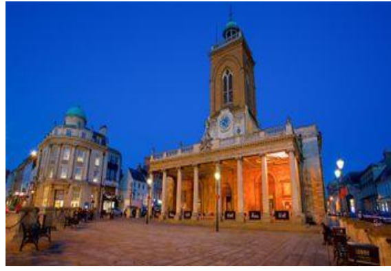
Photos of the Guildhall on the left, and All Saints Church on the right, in Northampton's town centre.