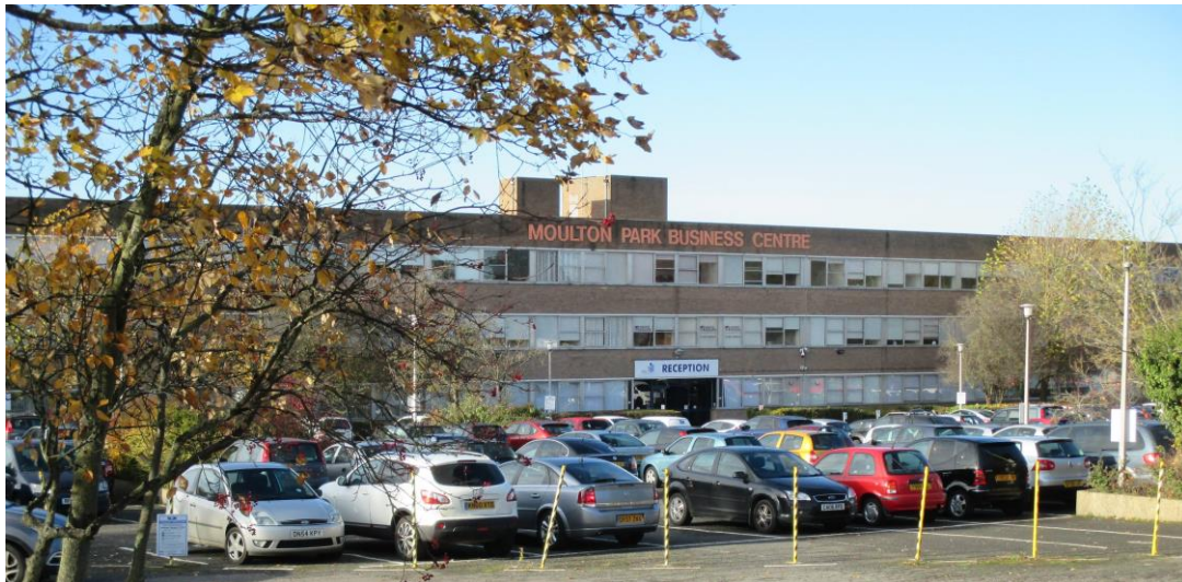
Moulton Park Business Centre – the course location

If you have any questions or require any further information about anything in this guide then please send an email to: training@sierra.co.uk